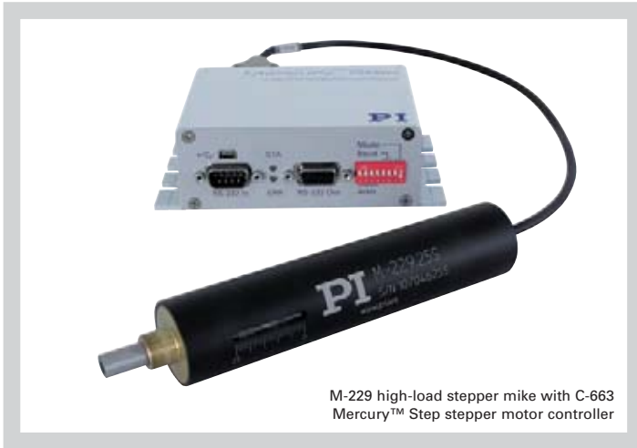
M-229 high-load stepper mike with C-663 Mercury™ Step stepper motor controller

Compact & Cost-Effective with Limit Switches, Force up to 50 N