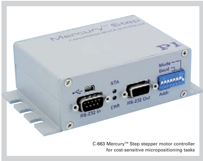
C-663 Mercury™ Step stepper motor controller for cost-sensitive micropositioning tasks