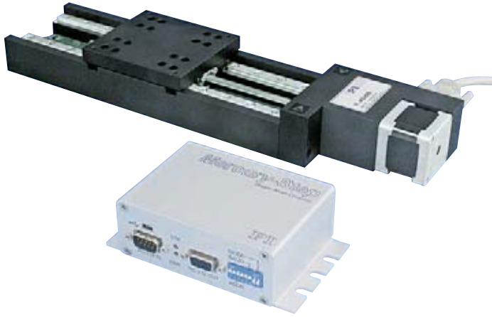
Mercury™ Step controller with M-403.62S precision translation stage